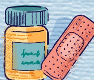
MEDICATIONS & SUPPLIES